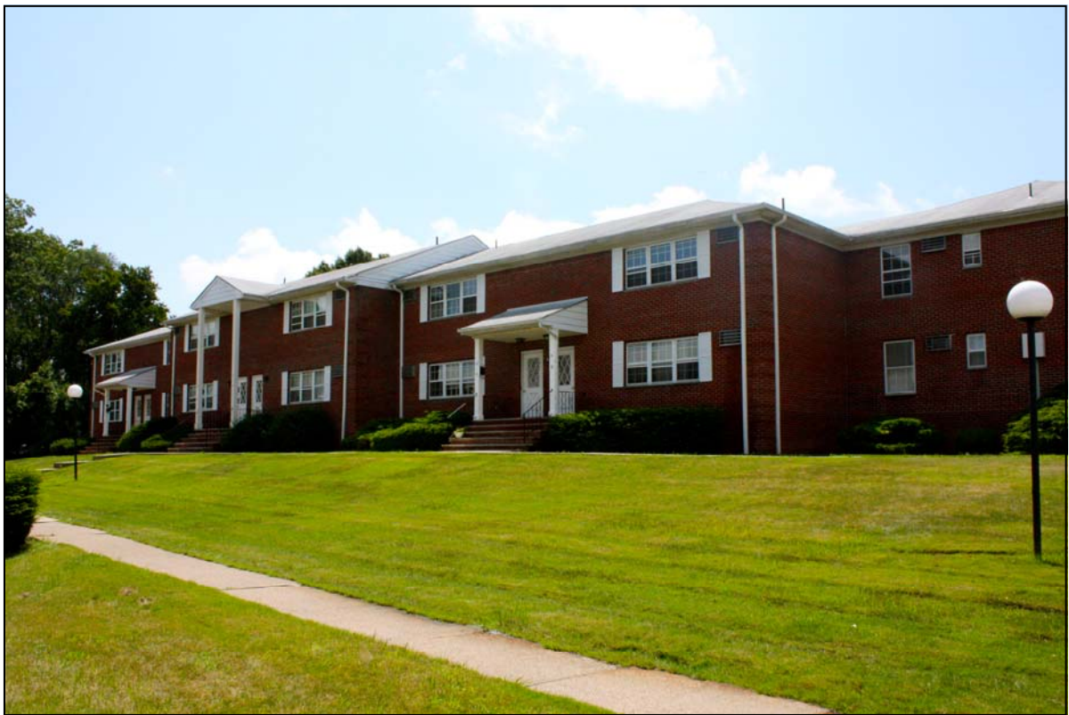
Garden Homes' Butler Ridge, a collection of garden-style apartments in Butler, Morris County.